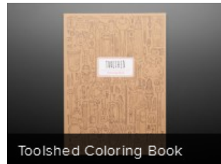
Toolshed Coloring Book