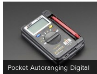
Pocket Autoranging Digital