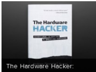
The Hardware Hacker: