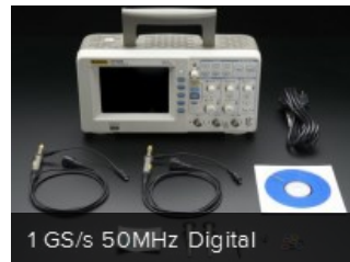
1 GS/s 50MHz Digital