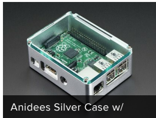
Anidees Silver Case w/