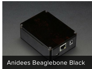
Anidees Beaglebone Black