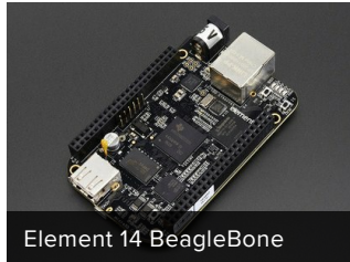
Element 14 BeagleBone