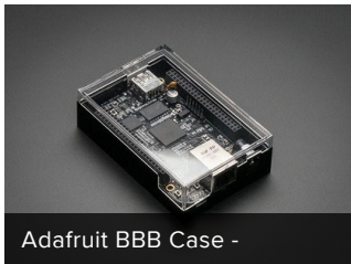
Adafruit BBB Case -