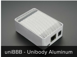
uniBBB - Unibody Aluminum