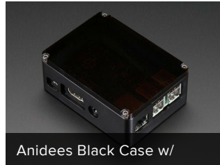
Anidees Black Case w/