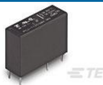
TE Part #1-1721081-4 PCJ-124D3MH,301