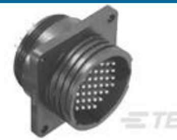
TE Part #1-206934-1 CPC RECPT ASSEMBLY SIZE 23-37