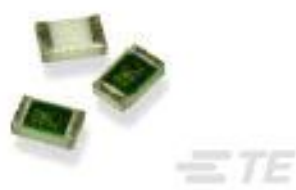
TE Part #8-1879213-1 CPF 0402 205R 0.1% 25PPM 1K RL