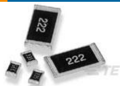
TE Part #1623021-1 CRG0603 5% 100R