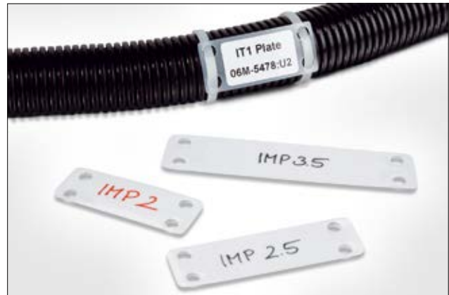
Unlimited cable bundle diameters can be securely identified.