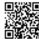
One Step to the Web!