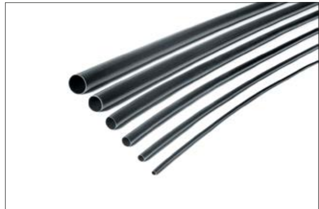
TA37 - adhesive lined tubing for safety sensitive areas.