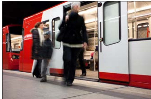
Mainly used in railway applications.