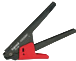
0 319 96