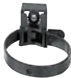
0 319 02