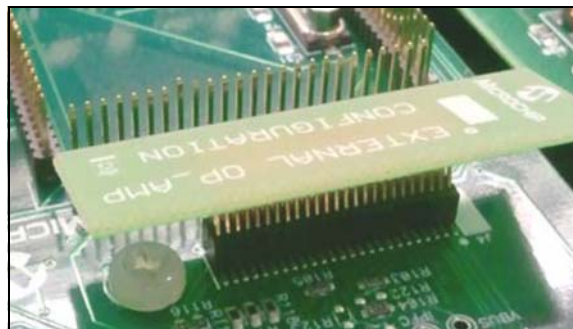
FIGURE 2: EXTERNAL OP AMP CONFIGURATION BOARD