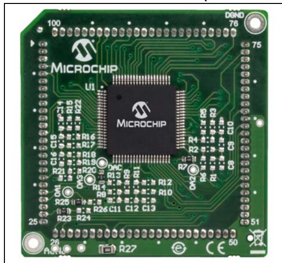
FIGURE 2: EXTERNAL OP AMP CONFIGURATION BOARD