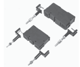
CAMaster accessories - Studs