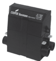
House service fuse holder black