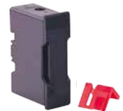
Safeclip fuseholder - black