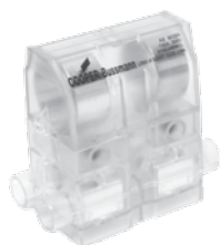
House service fuse holder clear