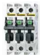
CCP - compact circuit protector