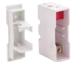
Safeclip fuseholder - white