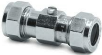
808 Ball valve

Chromium plated straight pattern brass service valve, copper x copper