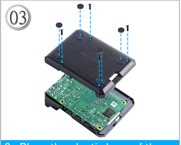
3. Place the plastic base of the NEO Case and secure the 4 screws and rubber footings.