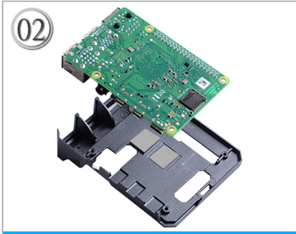
2. Align and put the Raspberry Pi on the middle of NEO Case.