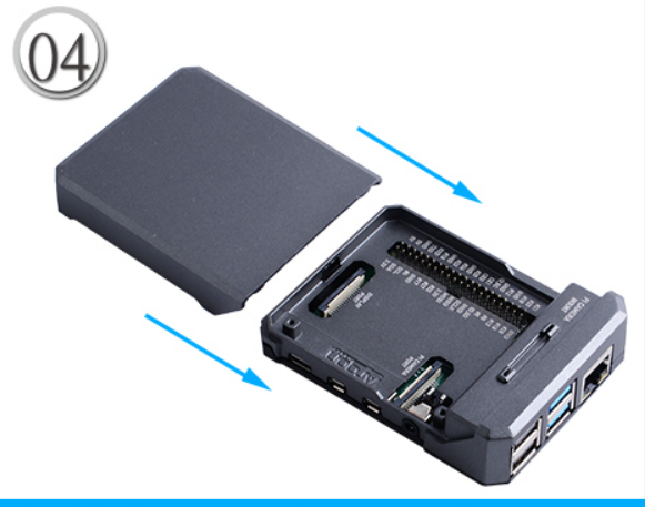
4. Slide magnetic cover to complete the NEO Case assembling.