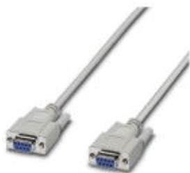
RS-232 cable, 9-pos. D-SUB socket on 9-pos. D-SUB socket, 9-wire, 1:1

Please be informed that the data shown in this PDF Document is generated from our Online Catalog. Please find the complete data in the user's documentation. Our General Terms of Use for Downloads are valid ( http://phoenixcontact.com/download )