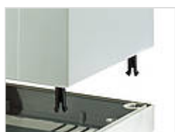
Quick-release fastener for EG 12.. - 20.., polyamide