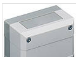
Lid fixing set from above for EG 12.. - 20..