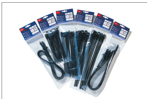
SOFTFIX ties available in small quantities.