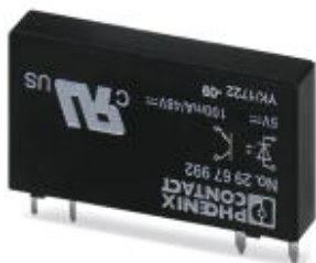
Plug-in miniature solid-state relay, input solid-state relay, 1 N/O contact, input voltage: 5 V DC

Please be informed that the data shown in this PDF Document is generated from our Online Catalog. Please find the complete data in the user's documentation. Our General Terms of Use for Downloads are valid ( http://phoenixcontact.com/download )