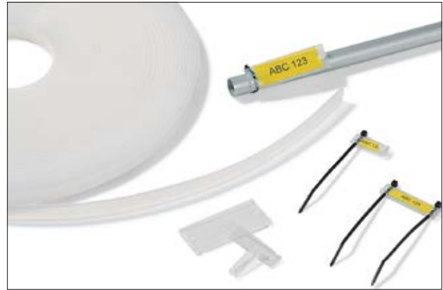
Multi-purpose identification potential: Helafix HC and HCR.