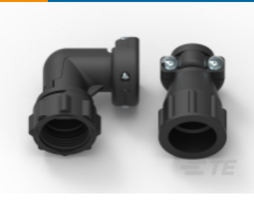
TE Part # CAT-AM71-C83998B CPC Cable Clamps