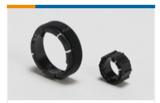
Circular Connector Adapters(7)