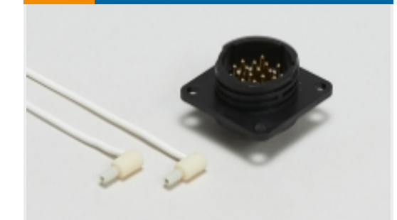
Circular Power Connectors(467)