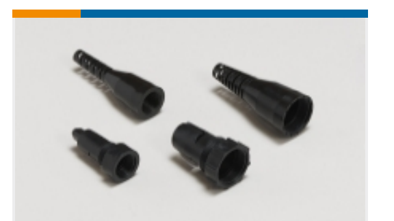
Circular Connector Boots & Strain Relief(6)