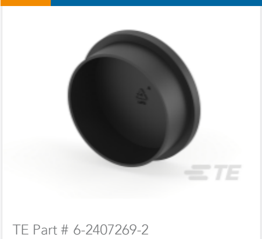
CAP, CPC, SIZE 23 RECP, BLACK