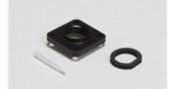
Circular Connector Seals(36)