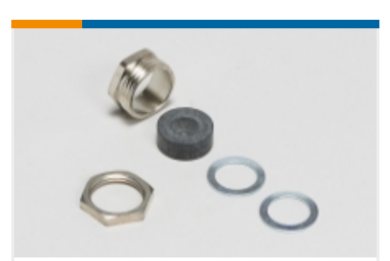
Circular Connector Hardware(3)