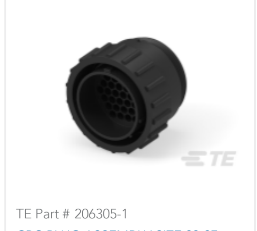
CPC PLUG ASSEMBLY SIZE 23-37