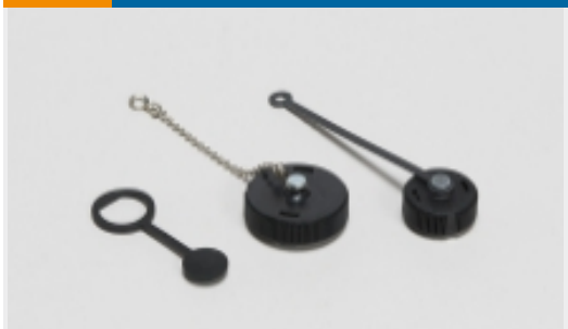
Circular Connector Caps & Covers(16)