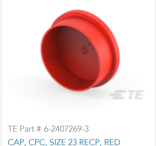
CAP, CPC, SIZE 23 RECP, RED