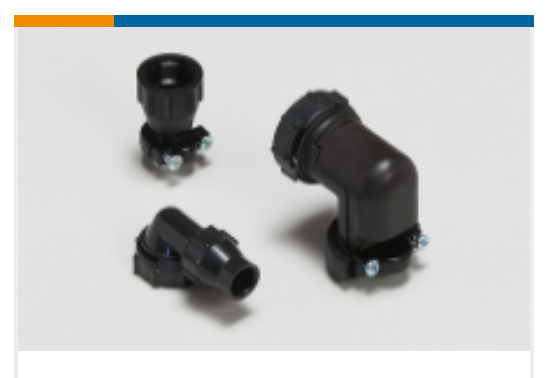
Unscreened Circular Connector Backshells & Clamps(56)