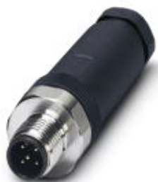
Sensor/actuator connector, male, straight, 5-pos., M12, screw connection, high-grade steel knurl, cable screw connection Pg9

Please be informed that the data shown in this PDF Document is generated from our Online Catalog. Please find the complete data in the user's documentation. Our General Terms of Use for Downloads are valid ( http://phoenixcontact.com/download )