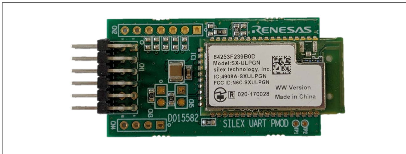
Figure 1. Wi-Fi Pmod™ Expansion Board

This document provides an overview of the Wi-Fi Pmod™ Expansion Board from Renesas that uses the SX-ULPGN Ultra-Low Power Wi-Fi module.