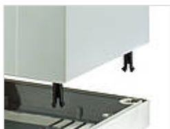
Quick-release fastener for EG 12.. - 20.., polyamide