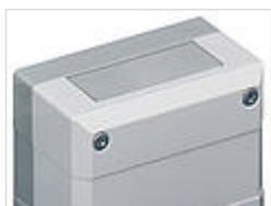
Lid fixing set from above for EG 12.. - 20..