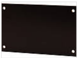
Mounting panel, laminated paper