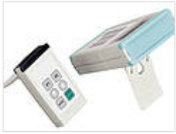
Universal clip and tip-up clip