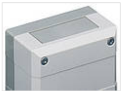
Lid fixing set from above for EG 12.. - 20..