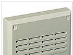
Screw cover, ABS