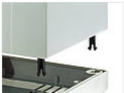
Quick-release fastener for EG 12.. - 20.., polyamide

For EG 1230, 1530, 2030, not for EG..30 F