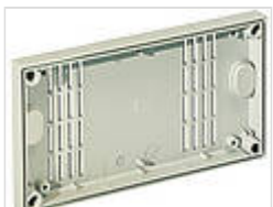
Covers for keyhole suspension