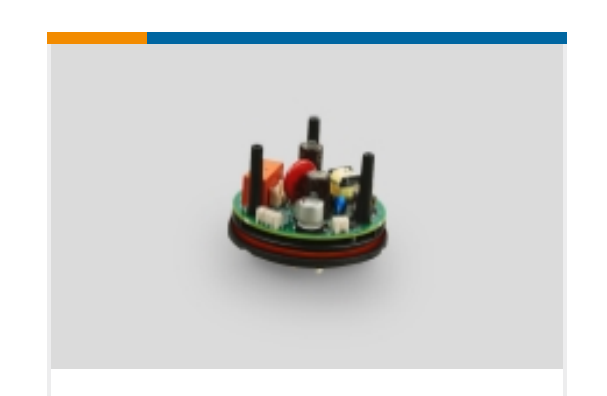
NEMA Base AC/DC Power Management(6)