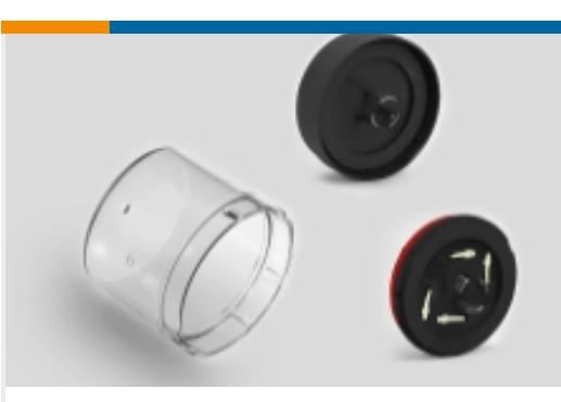
NEMA/ANSI Street Light Controls(34)