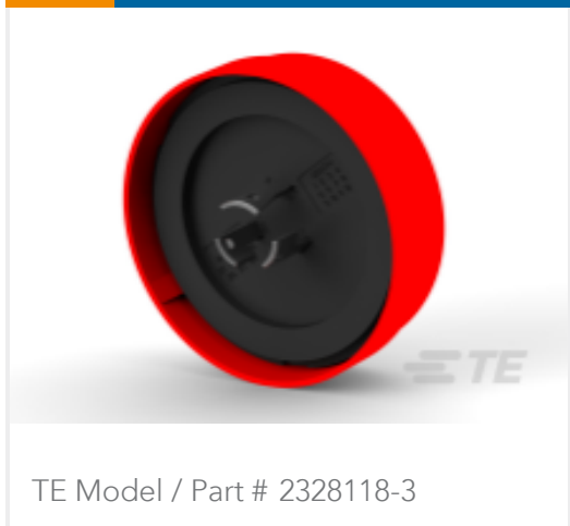
LUMAWISE ENDURANCE N OPEN CAP ASSEMBLY