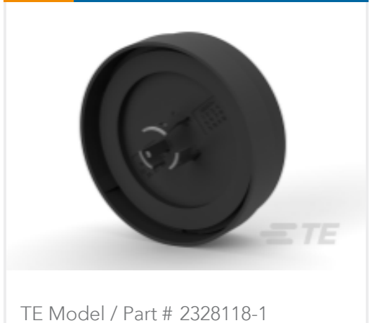
LUMAWISE ENDURANCE N SHORTING CAP