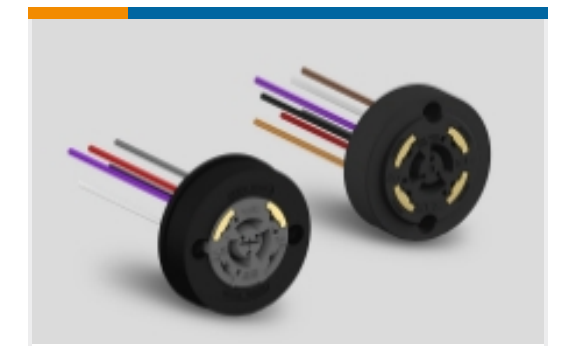
NEMA/ANSI Street Light Receptacles (26)