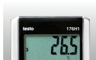
Large, clear display for showing measurement values