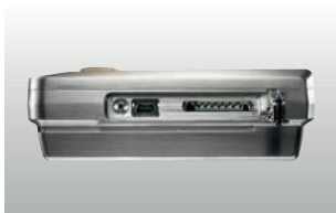
Lateral connection of Mini USB cable and SD card