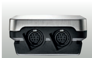
Probe connection at lower end of housing for two temperature/humidity probes