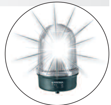
Two consecutive flashes generate brilliant signal