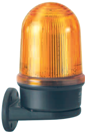
Plastic bracket (accessory)