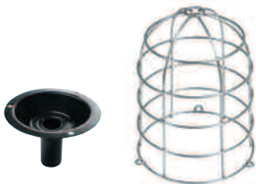
Flange for tube mounting and wire guard (accessories)