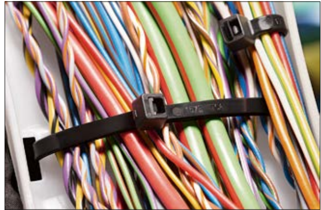
Standard T-Series cable ties – for almost any type of application.