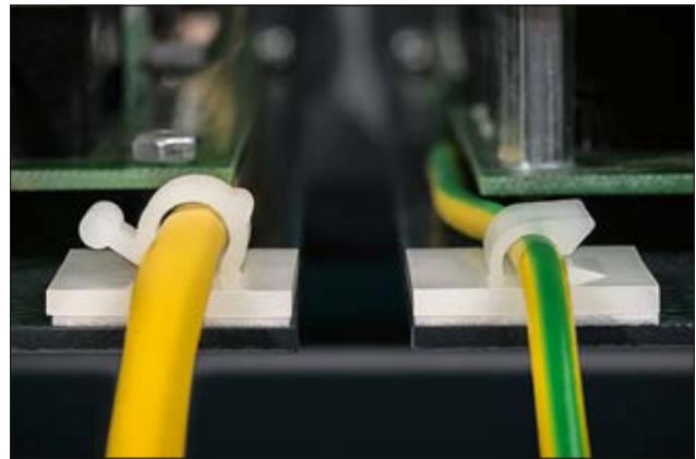
Self-adhesive one piece fixing clips RA6 (l) and RB5 (r).