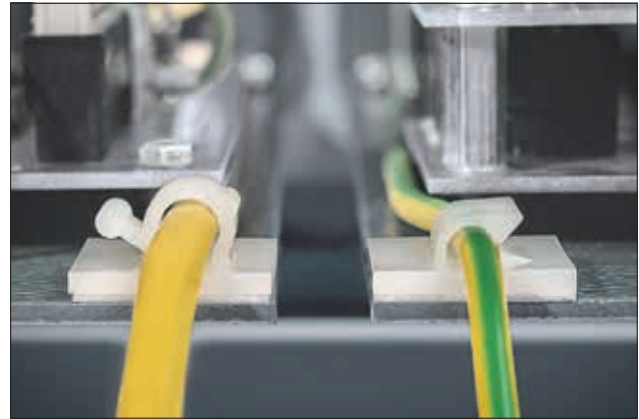
Self adhesive one piece fixing mounts RA6 (l) and RB5 (r).