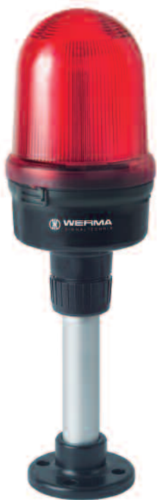
Tube mounting - tube and base for tube (accessories)