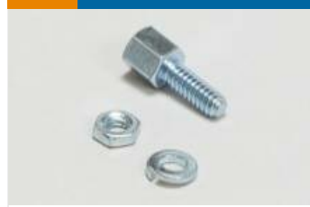
D-Sub Locking & Mounting (2)