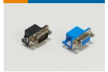
PCB D-Sub Connectors (7)