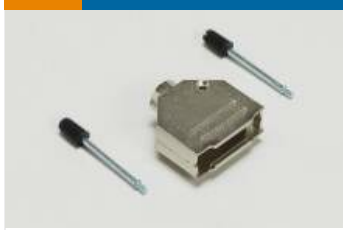
D-Sub Backshells & Clamps (5)