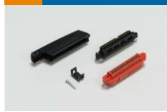
IDC D-Sub Connectors (4)