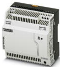
Primary-switched STEP POWER power supply for DIN rail mounting, input: 1-phase, output: 24 V DC/3.8 A

Please be informed that the data shown in this PDF Document is generated from our Online Catalog. Please find the complete data in the user's documentation. Our General Terms of Use for Downloads are valid ( http://phoenixcontact.com/download )