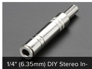
1/4" (6.35mm) DIY Stereo In-