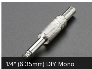
1/4" (6.35mm) DIY Mono