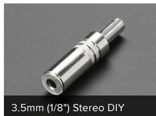
3.5mm (1/8") Stereo DIY