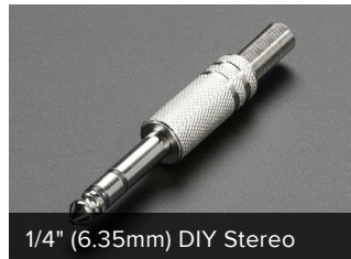
1/4" (6.35mm) DIY Stereo