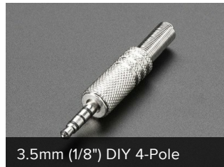
3.5mm (1/8") DIY 4-Pole