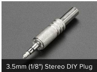
3.5mm (1/8") Stereo DIY Plug