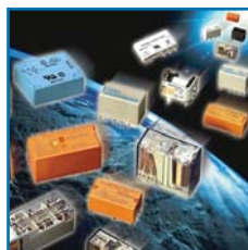
Schrack PCB Relays