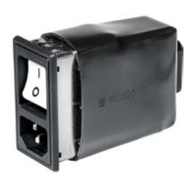
RC320 Rear Cover for Power Entry Module