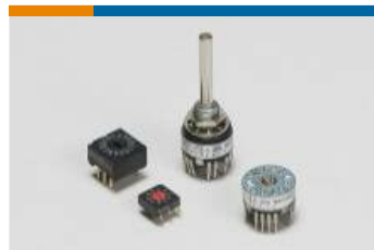
Rotary Switches (34)