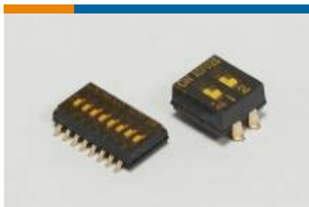
DIP & SIP Switches (256)