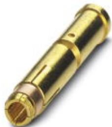
Crimp contact, turned, contact diameter: 2 mm, crimp range: 1.5 mm 2 ... 2.5 mm 2

Please be informed that the data shown in this PDF Document is generated from our Online Catalog. Please find the complete data in the user's documentation. Our General Terms of Use for Downloads are valid ( http://phoenixcontact.com/download )