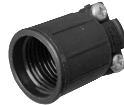
Mechanical Back Shell (Style #5)