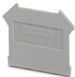
End cover, length: 42.5 mm, width: 1.8 mm, height: 35.9 mm, color: gray

Please be informed that the data shown in this PDF Document is generated from our Online Catalog. Please find the complete data in the user's documentation. Our General Terms of Use for Downloads are valid ( http://phoenixcontact.com/download )