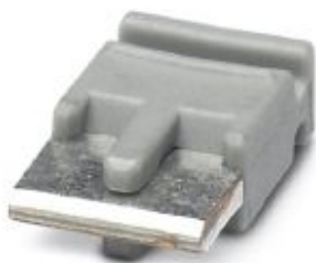
Single plug-in bridge, length: 6 mm, number of positions: 2, color: gray

Please be informed that the data shown in this PDF Document is generated from our Online Catalog. Please find the complete data in the user's documentation. Our General Terms of Use for Downloads are valid ( http://phoenixcontact.com/download )