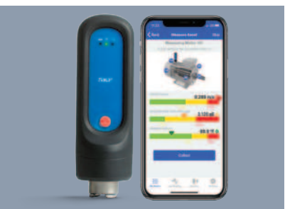
Measure vibration and temperature

CMDT 391-EX-PRO-K-SL CMDT 391-EX-K-SL kit plus: CMAC 8010-EX accelerometer cable CMSS 786A-IS accelerometer CMAC 3715 BNC adaptor CMAC 8011 carry case