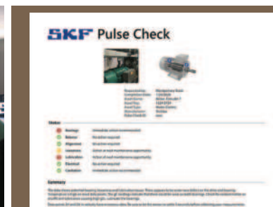
SKF Pulse Check reports

For more information, contact your SKF Representative, email skf.connected@skf.com or visit skfusa.com/skfpulse .