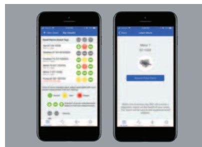
Monitor asset health