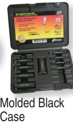
Molded Black Case