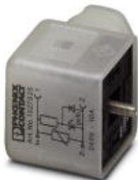
Valve connectors, 3-position, Valve connector A, with 1 LED, connected with Varistor, Screw connection, cable gland Pg9, external cable diameter 6 mm ... 8 mm

Please be informed that the data shown in this PDF Document is generated from our Online Catalog. Please find the complete data in the user's documentation. Our General Terms of Use for Downloads are valid ( http://phoenixcontact.com/download )