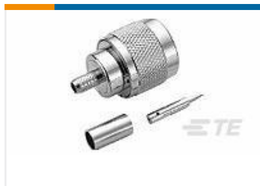
TE Part #1-1337416-0 N Str Plg Hex 50Ohm Silver Pltd RG58C/U,