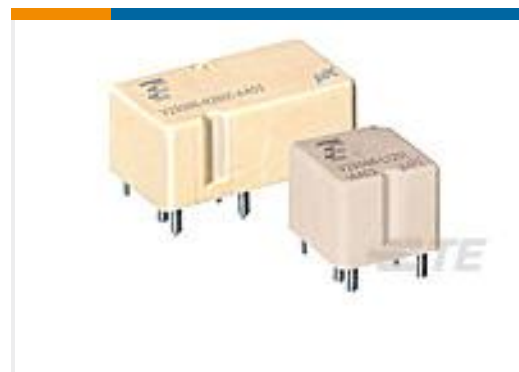
TE Part #1413009-9 V23086C2001A403