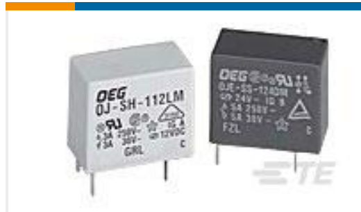
TE Part #1461247-3 OJ-SH-124LMH,000