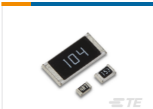
TE Part #4-2176337-6 CRGCO 0402 56K 1%