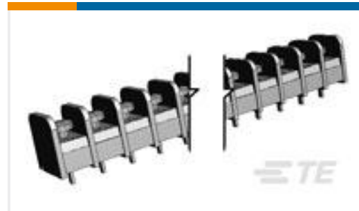
TE Part #1-1437664-7 NC6-P107-12=NC6 ASSEMBLY