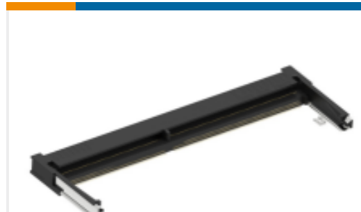
TE Part #2309409-2 DDR4 SODIMM 260P 5.2H STD