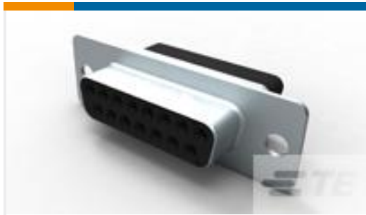
TE Part #205205-7 CRIMP SNAP RCPT ASSY, SIZE 2