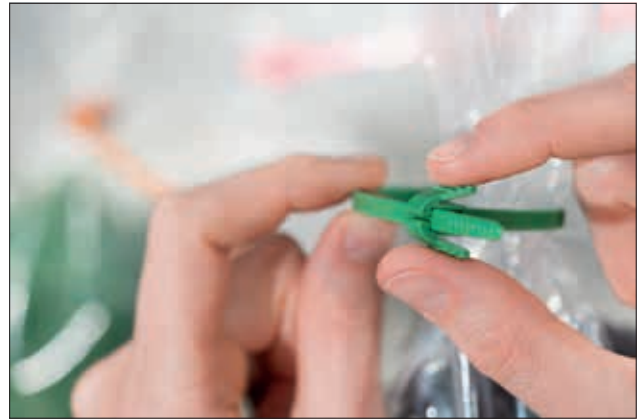
The inside serrated REZ ties have a one-hand, simple release mechanism.