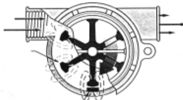
Hall-Effect-Sensor sends a voltage pulse with each pass of magnetic field

Gems Sensors popularised the Rotor-Flow's paddlewheel design by combining high visibility rotors with solid-state electronics that are packaged into compact, panel mounting housings. They provide accurate flow rate output with integral visual confirmation ... all with an unprecedented price/performance ratio.