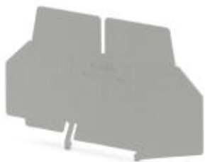
Separating plate, length: 105.2 mm, width: 1 mm, height: 67.5 mm, color: gray

Please be informed that the data shown in this PDF Document is generated from our Online Catalog. Please find the complete data in the user's documentation. Our General Terms of Use for Downloads are valid ( http://phoenixcontact.com/download )