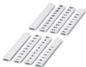
Zack marker strip flat, 10-section, horizontally labeled with the consecutive numbers: 51 ... 60, white

Please be informed that the data shown in this PDF Document is generated from our Online Catalog. Please find the complete data in the user's documentation. Our General Terms of Use for Downloads are valid ( http://phoenixcontact.com/download )