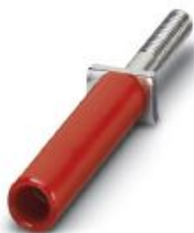
Female test connector, color: red

Please be informed that the data shown in this PDF Document is generated from our Online Catalog. Please find the complete data in the user's documentation. Our General Terms of Use for Downloads are valid ( http://phoenixcontact.com/download )