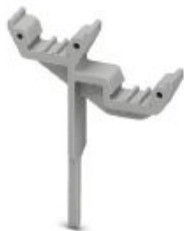
Marker carriers, gray, unlabeled, mounting type: plug in, lettering field size: 4 x 10.5 mm

Please be informed that the data shown in this PDF Document is generated from our Online Catalog. Please find the complete data in the user's documentation. Our General Terms of Use for Downloads are valid ( http://phoenixcontact.com/download )