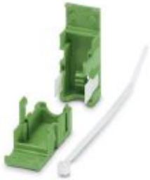
Cable housing, pitch: 0 mm, number of positions: 3, color: green

Please be informed that the data shown in this PDF Document is generated from our Online Catalog. Please find the complete data in the user's documentation. Our General Terms of Use for Downloads are valid ( http://phoenixcontact.com/download )