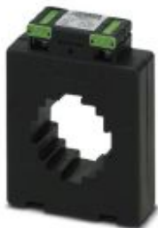
Window-type current transformer, 600 A AC primary current; 5 A AC secondary current; accuracy class 1; 10 VA rated power

Please be informed that the data shown in this PDF Document is generated from our Online Catalog. Please find the complete data in the user's documentation. Our General Terms of Use for Downloads are valid ( http://phoenixcontact.com/download )