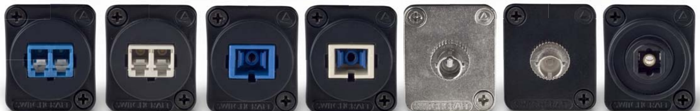
EHLC2 EHLC2M EHSC2 EHSC2M EHST2 EHST2MB EHTL2