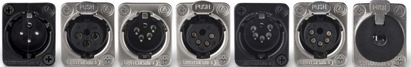
E3MSCB E3FSC E4MSC E4FSC E5MSCB E5FSC E112BL