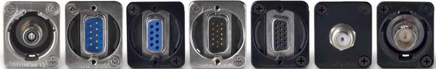
EHRCA2 EHDB9MF EHDB9FFB EHHD15MF EHHD15FFB EHFFB EHBNC2B